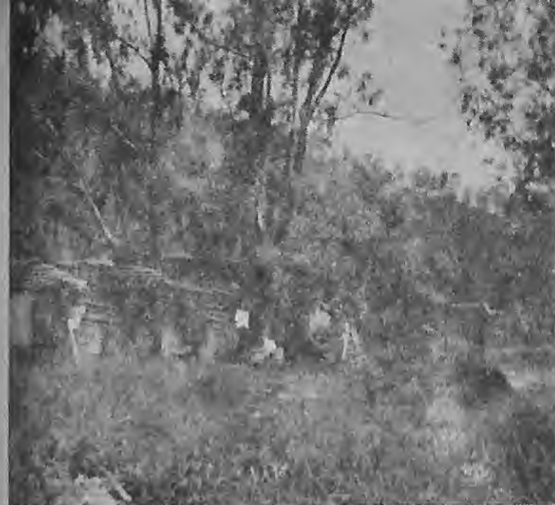
The first house of the Minim nuns in the Vergel